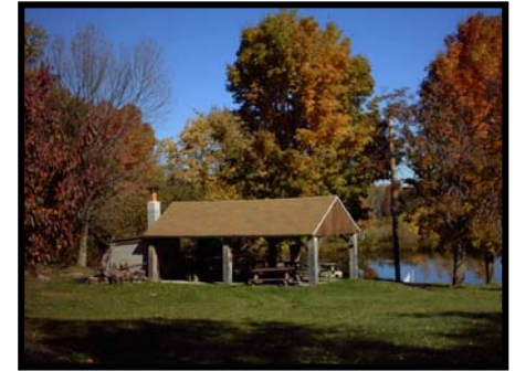
Picnic area includes pavilion, trails for cross country skiing, snowshoeing, hay rides and is the setting for our outdoor picnic

For an extra special adventure, how about pizza cooked in our outdoor pizza oven. You choose your toppings, we'll do the cooking. This meal will be eaten at our picnic pavilion and includes an outdoor fire to cook your s'mores. We'll also provide the roasting sticks!