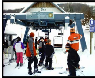
Holiday Valley Ski Resort