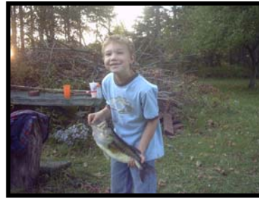
Fish for bass in one of our two ponds. Beauty View Farm's over 400 acres offers you many outdoor experiences